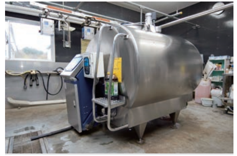
Milk Processing Unit