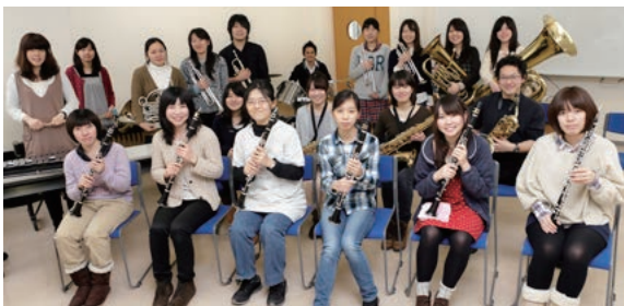
Aisokai, Wind Ensemble