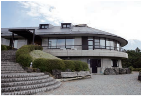
Fuji Seminar House