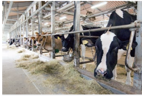
Milking Cow Shed