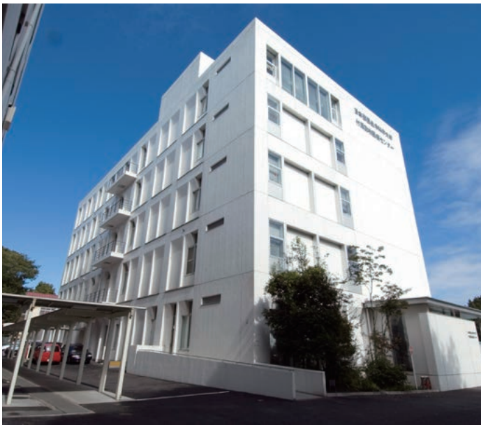
Veterinary Medical Teaching Hospital