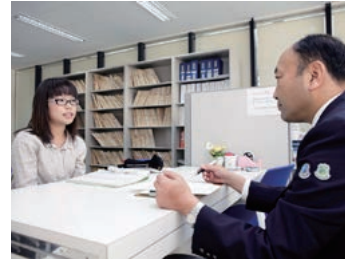
Career Support Center